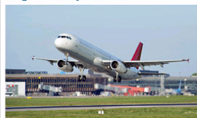
A major airline just slashed fares to 60+ cities across the U.S. Travel is valid into January 2010 with this deal. As seen on TRAVELZOO

UniData will show its top-notch products and contact people in related companies and industries in the international exhibition, which is referred to as the "Telecommunications Olympics" and recognized as a place where enterprises and organizations from around the world would compete with one another to show their technological development achievements. This time, the company's prime aim is to find new competitive partners and distributors over the world to show its advanced technologies and new products and conducting effective marketing strategies.